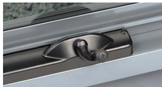
Ergonomically designed handle