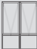
Double awning over double fixed light