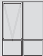
Awning and fixed light over double fixed light

Awning windows can be manufactured to your preferred window height with customised galleries available.