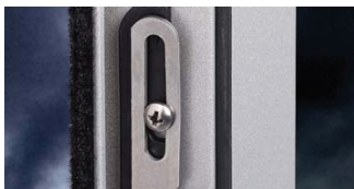
Fully adjustable sash keeper