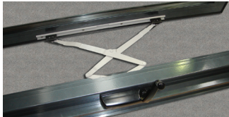
Stylish smooth opening