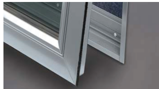
Substantial mitred sash profiles