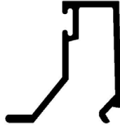
EU8857 23mm BEAD