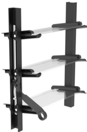
Ring Pull Handle