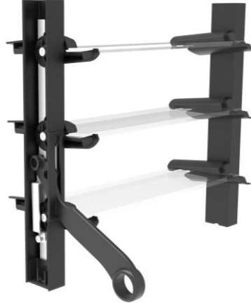
Ring Pull Handle