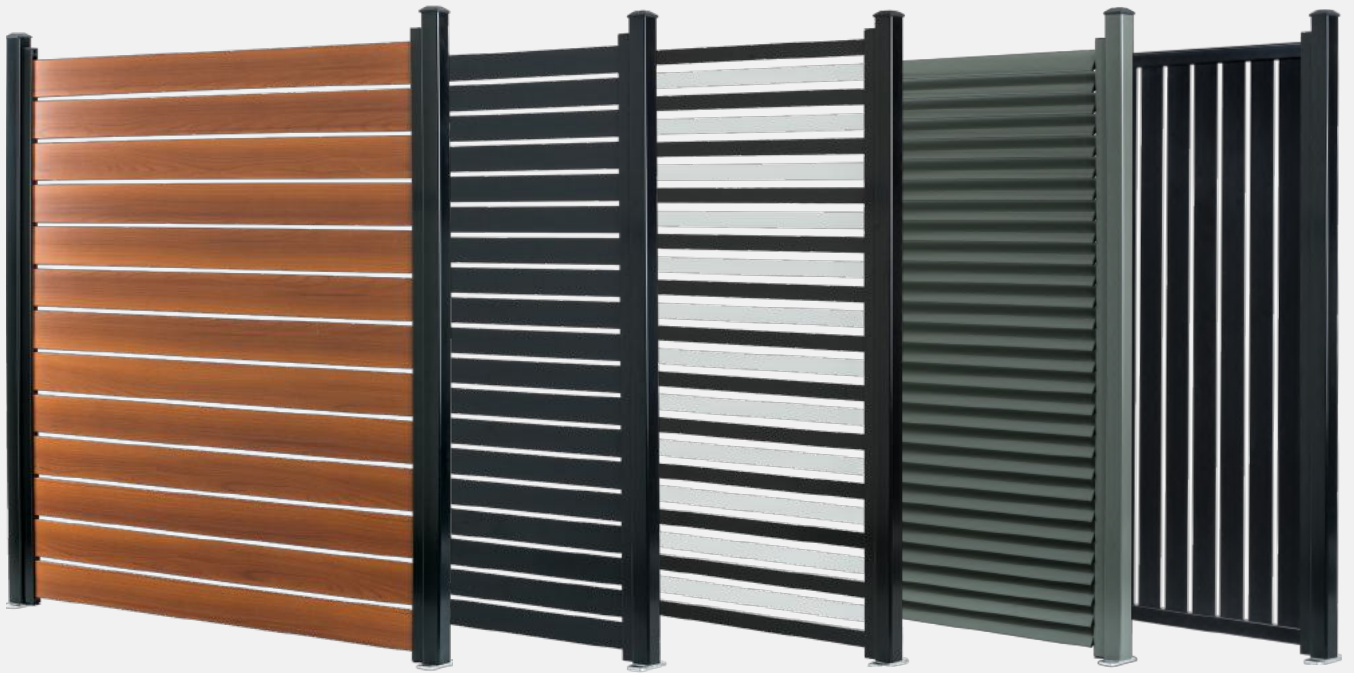
100mm Timber-look Slat ▲